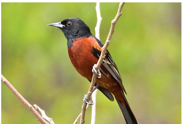
First-spring male Orchard Oriole (Bill Archer). Adult male Orchard Oriole (Chris Talkington).