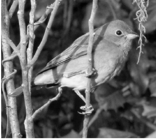
Painted Bunting, Manteo, NC, 31 Jan 2007.

YELLOW-HEADED BLACKBIRD: A male Yellow-headed at the Pungo Unit of Pocosin Lakes NWR, NC 4 Feb (Lex Glover) was the only one mentioned this winter.