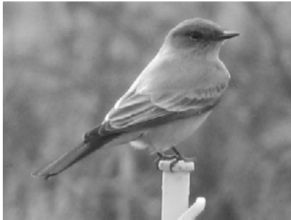
Say's Phoebe, Wayne County, NC, 13 Jan 2007.