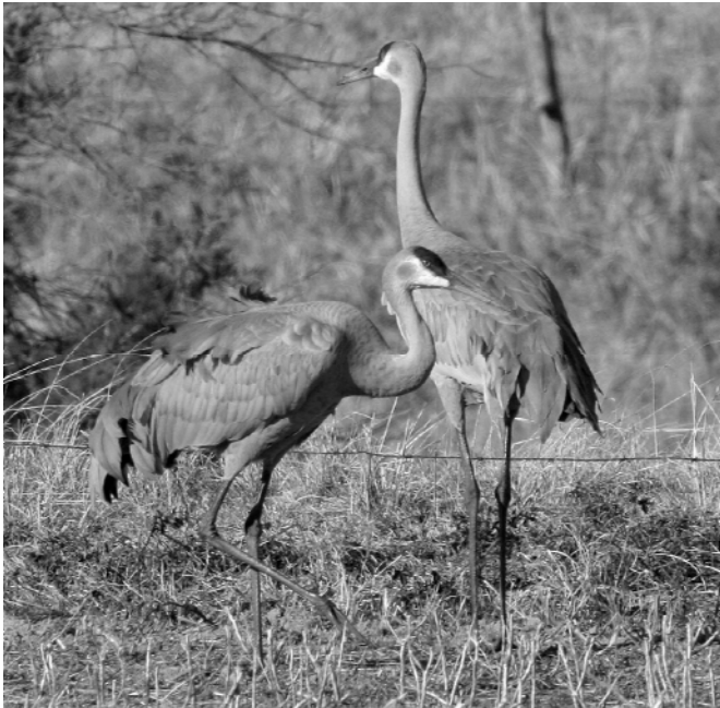
Sandhill Cranes, Swansboro, NC, 18 Feb 2007.