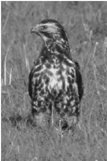
Swainson's Hawk, Alligator River NWR, 26 Dec 2006.