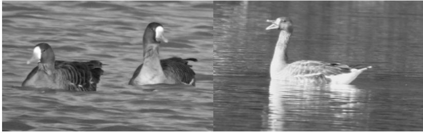
Greater White-fronted Geese. Left: Lake Townsend, NC, 14 Feb 2007. Right: Lake Hartwell, SC, 17 Dec 2006.