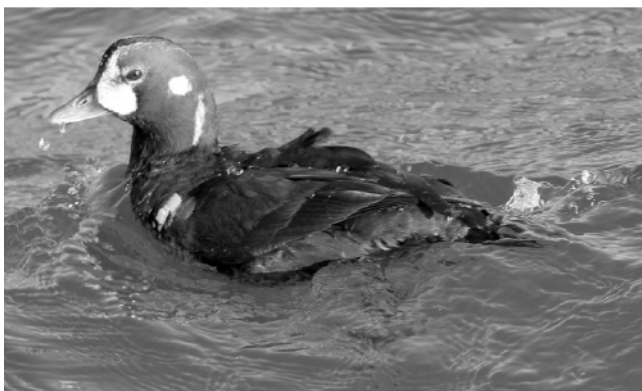
Harlequin Duck, Wrightsville Beach, NC, 20 Dec 2006.