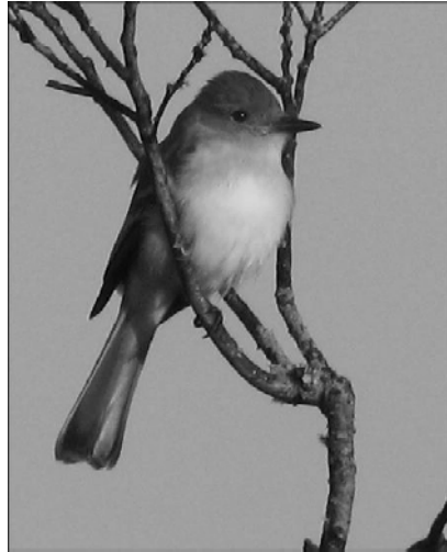
Ash-throated Flycatcher, North River Farms, 7 Jan 2007.