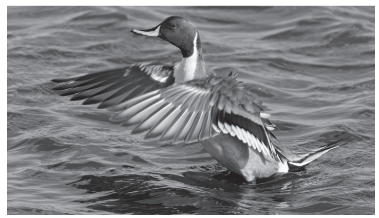
Northern Pintail at Bodie Island

The trip ended in the early afternoon at Alligator River NWR. Here a trio of upstart River Otters threatened to push aside the rafts of ducks and swans for top billing. The trip ended with just over 100 species observed, which is not too bad considering that very few woodland birds made their way to the list. We may not have seen a cardinal, but we would gladly trade that sighting for those Snow Buntings!