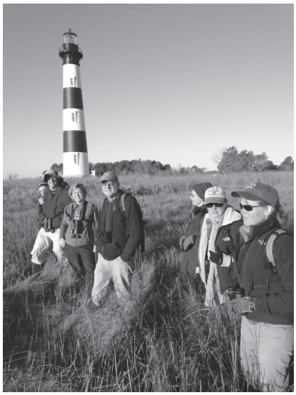
WOW participants enjoy "railing" at the Bodie Island lighthouse pond.

The early dates also meant a number of lingering warblers were to be found, and no less than fifteen species were located. This included a pair of Nashville Warblers that gave great views as they foraged day after day in the same row of orna-