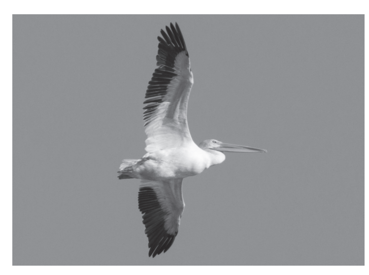
American White Pelican at Pea Island

We hope to see you on a CBC "bonus trip" in the future; keep an eye out for new trip announcements in upcoming editions of the CBC Newsletter and on the club's website at www.carolinabirdclub.org