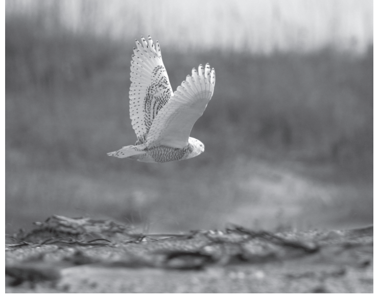
Snowy Owl at Cape Hatteras - Phil Fowler

a Humpback Whale feeding within sight of the pier was the non-avian highlight of the day. The whale's frothy blow could be seen on and off for more than thirty minutes as the "long winged New Englander" chased schools of baitfish with groups of Inshore Bottlenose Dolphins in attendance. At one point the whale's lunge feeding brought the massive jaws out of the water, and the low, bumpy back that gives this whale its name was often visible.