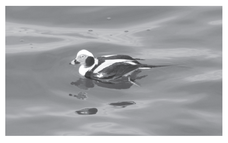
Drake Long-tailed Duck

Harbor Seals on islands three and four entertained as they porpoised, bobbed, and sunbathed, while a pair of Yellow-rumped Warblers proved that there really are few habitats that the little birds will not occupy.