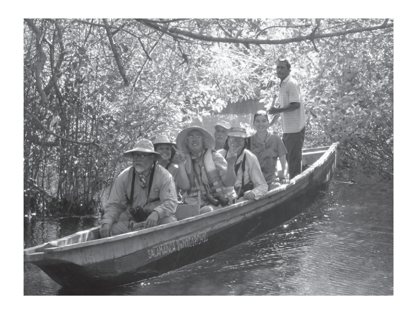
Birding... CBC style!

The Carolina Bird Club recently donated to the conservation organization Saving Species, whose main objective is to stop extinctions in the most biodiverse and threatened places in the world. Saving Species has funded conservation projects in Brazil, Madagascar, and Colombia. This collective of senior conservation scientists invests all its donations into the protection or restoration of important habitat for critical species by partnering with local organizations. The funds donated by the CBC will contribute to bird conservation in Colombia in places that generate the largest conservation benefit by protecting high concentrations of endemic and threatened birds. This donation was inspired by the success of a recent CBC bonus field trip to Colombia led by the authors. Colombia is home to more bird species than any other country in the world, but unfortunately many are at risk of extinction. The trip leaders and CBC executive committee agreed that a portion of any unspent trip funds should be set aside for bird habitat conservation in Colombia, and we felt that Saving Species would be an ideal recipient for such a donation due to their ongoing conservation efforts in Colombia. For more information on Savings Species, see <a href="http://savingspecies.org">http://savingspecies.org</a>.