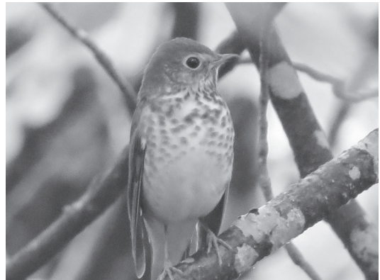
Swainson's Thrush by Sherry Lane

I think the best story of the weekend occurred when we were all standing alongside the Parkway in a beautiful field of yellow fall flowers, training binoculars on one of those confusing fall empids. The “Traill’s Flycatcher” put on a good show, and the sight of a bunch of people standing alongside the road often slows traffic. Most speed up and get out of Dodge as quickly as possible once we tell them that, no, we are not looking at bears. Well, this car slows and stops, the woman driving leans out the window, surveys the group peering through binoculars into a small tree and asks, with all seriousness, “are ya’ll fishing?” And no, there was not a stream or creek anywhere nearby.