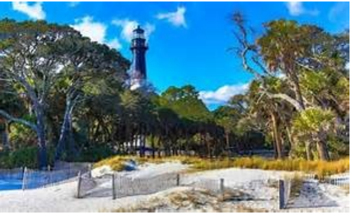
Hunting Island State Park, SC

The field trips will take full benefit of fall migration. Migration concentrates on the coast and Beaufort will take full advantage by featuring the coastal plain. Field trips will travel to various habitats, such as Bear Island WMA, Donnelly WMA, Pinckney Island, Hunting Island, Savannah River Spoils Site and Savannah NWR.