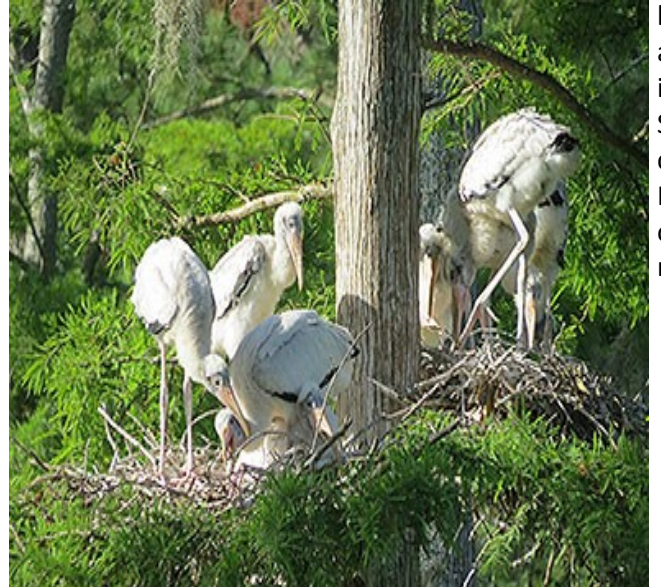
Nesting Wood Storks— SC Department of Natural Resources

From an SCDNR News Release -"Similar to last year, 2015 was an excellent year for Wood Storks ( Mycteria americana ) nesting in South Carolina. 'The number of wood stork nests counted in South Carolina during 2015 (2,496 nests) was only slightly lower compared to 2014 (2,501 nests), the state record'said Christy Hand, S.C. Department of Natural Resources (DNR) Wildlife Biologist. 'Chick survival was also very high for the second year in a row.' "