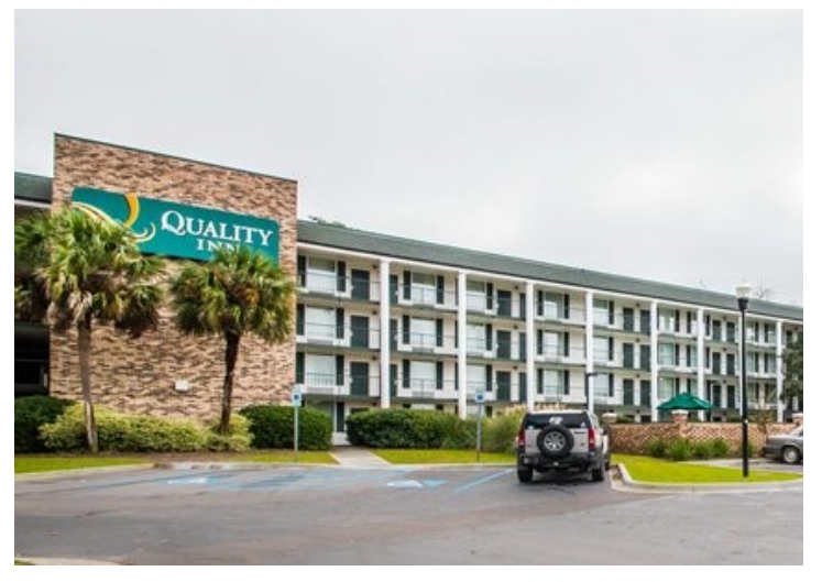
Quality Inn Town Center, Beaufort, SC

Our headquarters will be the Quality Inn at Town Center, at 2001 Boundary Street, in downtown Beaufort. The hotel is situated just a few blocks from the historic section of town.