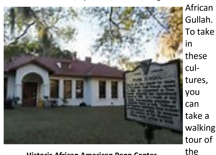
Historic African American Penn Center, St. Helena Island, Beaufort County, SC

In addition to the speakers, the field trips and the birds, Beaufort is an extraordinary and picturesque setting. Beaufort has churches and mansions as far back as 1720's. Beaufort's cultures are a blend of Native Americans, Spanish, French, English and the