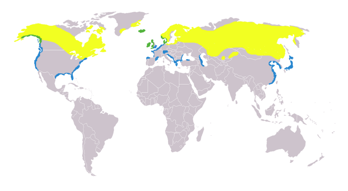
The Red-breasted Merganser <u>breeding habitat</u> is freshwater <u>lakes</u> and <u>rivers</u> across northern <u>North America</u>, <u>Greenland</u>, <u>Europe</u>, and <u>Asia</u>. It nests in sheltered locations on the ground near <u>water</u>. It is <u>migratory</u> and many northern breeders winter in <u>coastal</u> <u>waters</u> further south.

Fortunately the birds also found the lee to their liking, and we were able to leisurely observe Purple Sandpipers going about their business, Ruddy Turnstones looking for Cheetos, Surf and Black Scoters drifting on the sea, and Great Cormorant, Brant, Greater Scaup, long skeins of Red-breasted Merganser, and more.