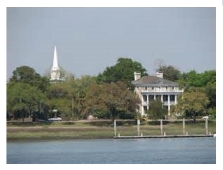
Scenic and Historic Beaufort, SC

The coast of South Carolina offers great fall birding! The last meeting in Beaufort, SC was held in the fall of 2011. Participants tallied 203 species, which ties for second highest in the CBC records. On top of high species count, Beaufort offers diverse field trips and experienced field trip leaders.