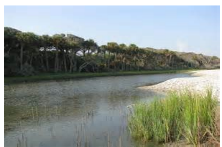
Botany Bay Plantation, Edisto Island, SC

These interesting and enjoyable field trips will yield excellent bird counts. In 2011, 28 warbler species were seen, which included Golden-winged, Tennessee, Nashville, Chestnut-sided, Magnolia, Blackburnian, Blackpoll, Worm-eating and Swainson's. Additional species seen were Mottled Duck, Ruddy Duck, Least Bittern, Reddish Egret, Roseate Spoonbill, Wood Stork and Seaside Sparrow. In 2016, we will offer these trips and additional trips to Botany Bay Plantation and ACE Basin. (Continued p.8)