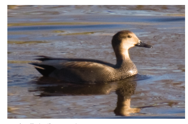
Gadwall. (Jeff Lemons)

The continental population of Gadwall appears to be faring well. In addition, the 2015 Mid-winter Waterfowl Survey conducted in North Carolina reported an estimate of 41,788 Gadwall which is a +102% change from the 10-year average and a whopping +445% change from the 64-year count average. South Carolina duck harvest data from the Broad River indicate Gadwall is the fifth most harvested duck over the past 12 years.