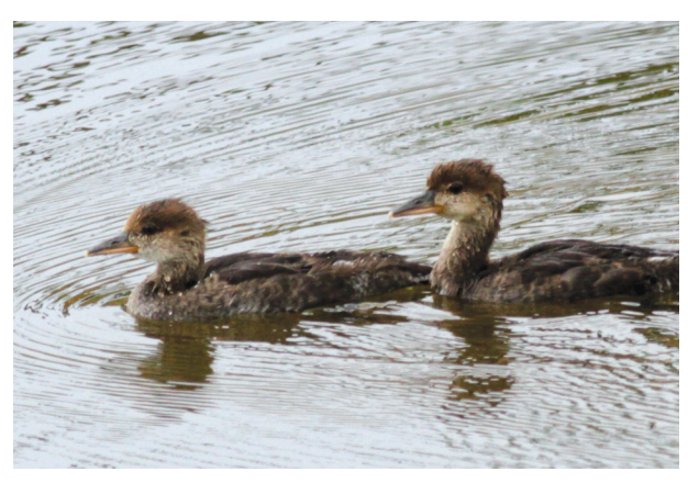
Young Hooded Mergansers in Mecklenburg County.