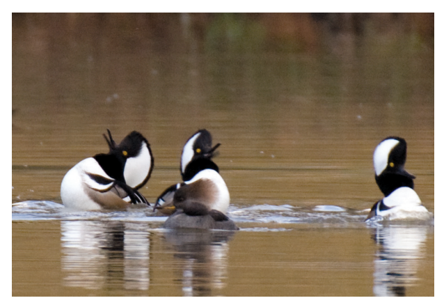
Males courting a female at Cowan's Ford Wildlife Refuge. (Jeff Lemons)

Artificial wood duck nest boxes are crucial to the