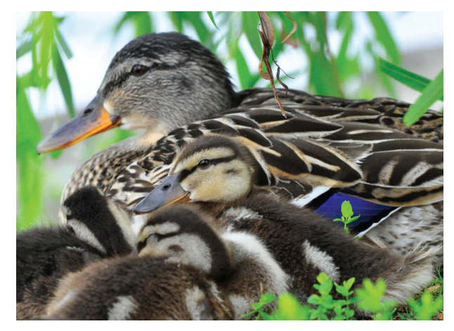
A female Mallard with young.