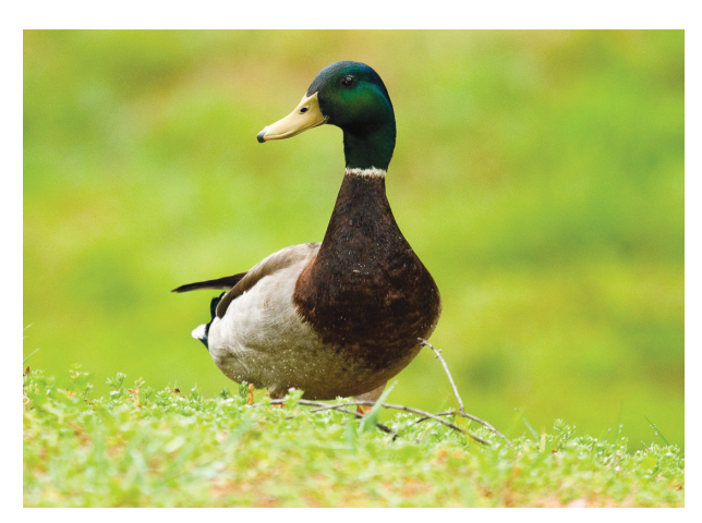
Male Mallard.