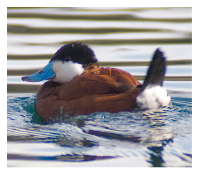
Male Ruddy Duck.

According to the U.S. Fish and Wildlife Service, the breeding population of Ruddy Duck in North America appears to be stable. The 2015 population survey in North Carolina indicated a no change (0%) from the 64-year average.