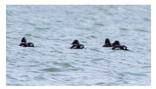
White-winged Scoters on Mountain Island Lake.