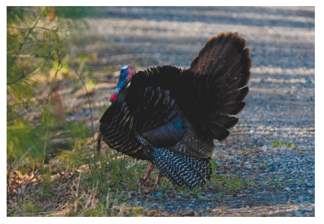
A male displaying at Cowan's Ford Wildlife Refuge.

Today, due to the assistance of man, a breeding population of Wild Turkey now exists throughout the Central Carolina region. Once again the loud gobbles of the bearded tom turkeys can be heard echoing in local forests each spring, as they strut about fanning their tails, displaying, and drumming for all the hens. Turkeys are now being seen in fields and forested areas and even in some suburban subdivisions throughout the region. In 2001, a pair of Wild Turkey was found during count week of the Charlotte Christmas Bird Count—the first ever recorded on this count—which has been held annually since 1941. Flocks of more than 30 birds have been seen in Mecklenburg County. Unfortunately, habitat