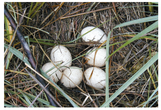
Wild Turkey nest at Cowan's Ford Wildlife Refuge.