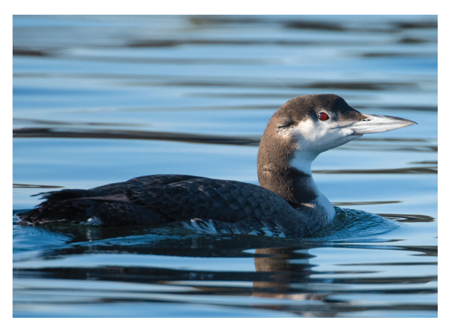
Common Loon in winter plumage on Lake Norman. (Jeff Lemons)

The Common Loon sits low in the water with the head and beak in a parallel plane with the surface, a feature which always distinguishes it from the Red-throated Loon. In diving, it leaps forward and disappears in an instant, so quickly, indeed, that it is said to be able to dodge a load of shot. The flight is strong and attains considerable velocity. J.A. Pittman, flying a light plane between Huntersville and Davidson, NC, on May 9, 1947, clocked a loon at 90 miles an hour, at 1200 foot altitude.