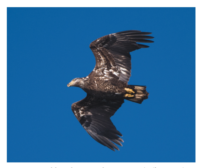
Immature Bald Eagle over Lake Norman. (Jeff Lemons)

A survey conducted in 1973 by the U.S. Fish and Wildlife Service found only 627 active nests in the lower 48 states. No active Bald Eagle nests were found in North Carolina, and only two nests were found in South Carolina. Of those two nests, only a single chick hatched. In the 1970s, the sale of DDT was banned, and an interstate team of experts began working on the protection of existing nests in the Southeast. In 1979, a national survey conducted by the National Wildlife Federation estimated a grand total of 5,000 eagles in the lower 48 states—a total of six Bald