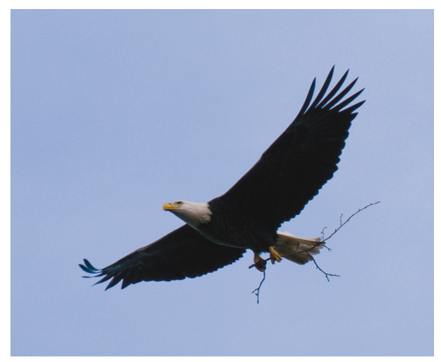
Bald Eagle with nesting material. (Jeff Lemons)