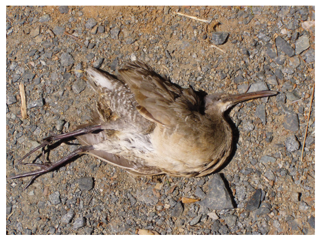
Clapper Rail found dead in downtown Charlotte.