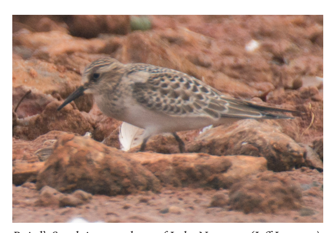
Baird's Sandpiper on shore of Lake Norman.