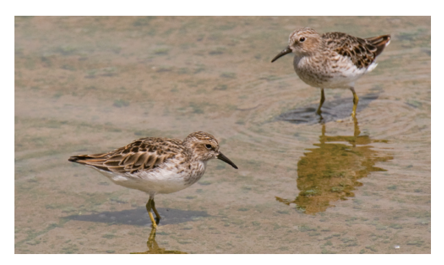
Least Sandpipers at wastewater treatment plant. (Jeff Lemons)

As its name suggests, the Least Sandpiper is our smallest peep, averaging only 6 inches in length. Small numbers have been found at scattered locations in our region in all months—except June. They are uncommon in both spring and fall migration and are usually rather rare in the winter months. Average flock size seen in the Central Carolinas is ordinarily less than 15 birds. A flock of more than 25 spent much of the winter of 2011–2012 in Pineville at the McAlpine WWTP. These birds spent time moving around the edges of the treatment ponds and foraging among grass stubble with a flock of American Pipits. A flock of 60 found on Lake Twitty in Union County on November 17, 2008, and a flock of 68 found at the McAlpine Plant on May 11, 2015, appear to be the largest counts of Least Sandpiper reported in the region.