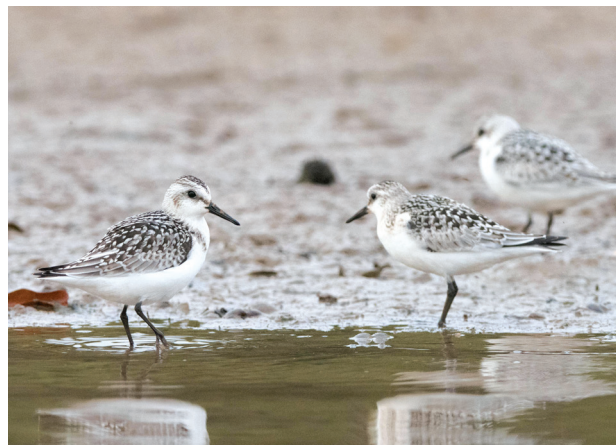
Group of Sanderlings on the Catawba River.