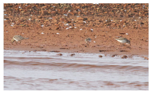
Western Sandpiper (right) with Least Sandpiper on Governor's Island in Lincoln County. (Chris Talkington)

There have been five reports from Catawba County in recent years. One Western Sandpiper was reported on Lake Norman near Mountain Creek Cove on September 15, 2011, and single birds were reported on Lookout Shoals Lake on August 29, 2012, and at Riverbend Park on September 1, 2012. A total of five were seen at the Upper Lake Norman Cove on August 12, 2015, and one was reported at Mountain Creek Cove on August 16, 2015.