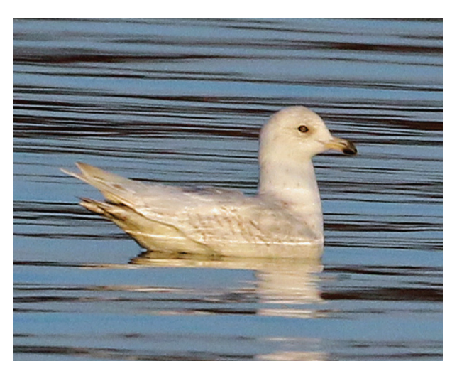
Iceland Gull on Lake Norman. (Jim Guyton)