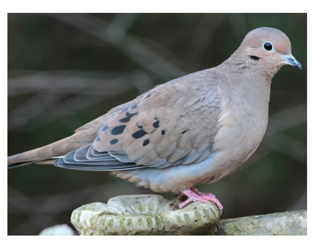
Mourning Dove on bird bath. (Will Stuart)

—The Mountain Scout (Taylorsville), March 29, 1916