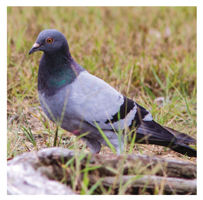
Rock Pigeon.

"Two little boys that I happen to know of managed to get hold of three or four pairs of squabs about fifteen months ago, and now they have a flock of about eighty