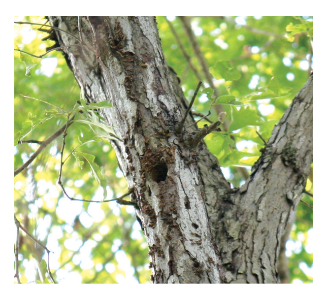
Downy Woodpecker nest hole in a dead limb of a living white oak. (Leigh Anne Carter)

Not all woodpeckers forage solely on trees. Downy Woodpeckers can be seen in this region foraging in abandoned fields in late fall and winter. They often rely upon gall insects as a supplemental food source for winter survival. Galls are ball-shaped structures that are often found growing on the stalks of our abundant fall goldenrod flowers ( Solidago spp.). The woodpeckers seek