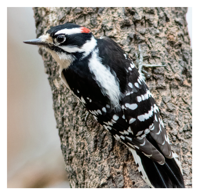
A male Downy Woodpecker. (Gary P. Carter)

Breeding activity of the Downy Woodpecker begins early and lasts until at least late spring. Bill and Laura Blakesley observed a pair of Downy Woodpeckers actively excavating a nest cavity on January 16, 2011, along the Four Mile Creek Greenway while a pair of Brown-headed Nuthatches kept trying to get a look inside. Mecklenburg County BBA volunteers observed Downy Woodpeckers nesting in a variety of places: a cavity about 6 feet off the ground in an 8-inch-diameter sweetgum tree; a hole about 5 feet off the ground in the siding of a residential home; and in a hole about 20 feet off the ground in a dead limb of a living white oak. The adults at the latter nest were observed gathering suet at a bird feeder and feeding it to their young who "poked their head out of nest hole" on 2 May.