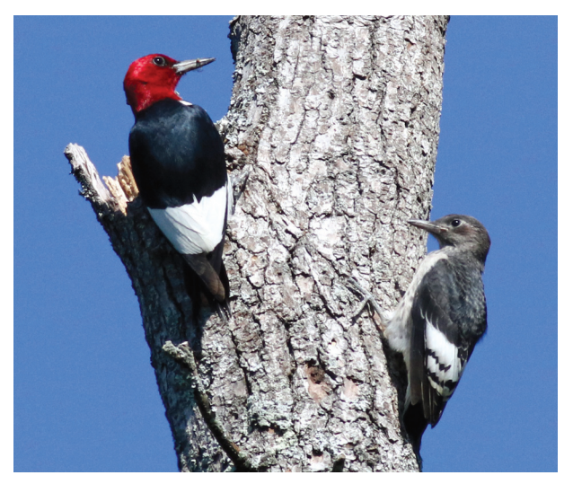
Red-headed Woodpecker with young. (Will Stuart)

In the late 1870s, Leverett Loomis described the Redheaded Woodpecker as abundant in the summer in