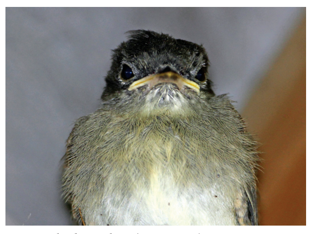
Eastern Phoebe nestling. (Jim Guyton)