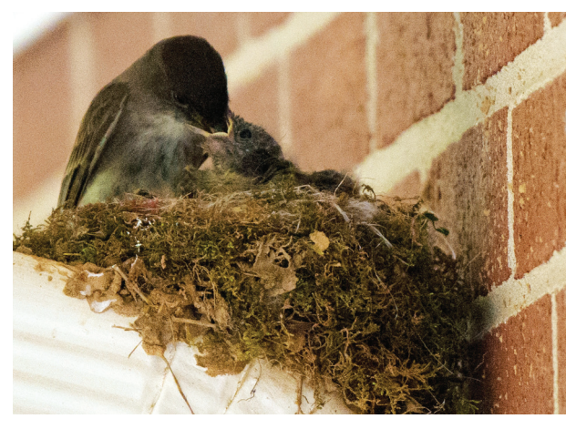
Eastern Phobe nest on downspout.

It is important to note that periods of unusually cold weather can occur during any winter season and these pose a serious risk to all wintering birds. A series of snow storms surprised Gaston County residents in early 1960 resulting in the deaths of many birds, including the Eastern Phoebe. This event sparked a community conversation on the plight of birds and spurred interest in establishing backyard "bird cafeterias" to help the birds make it through that difficult winter.