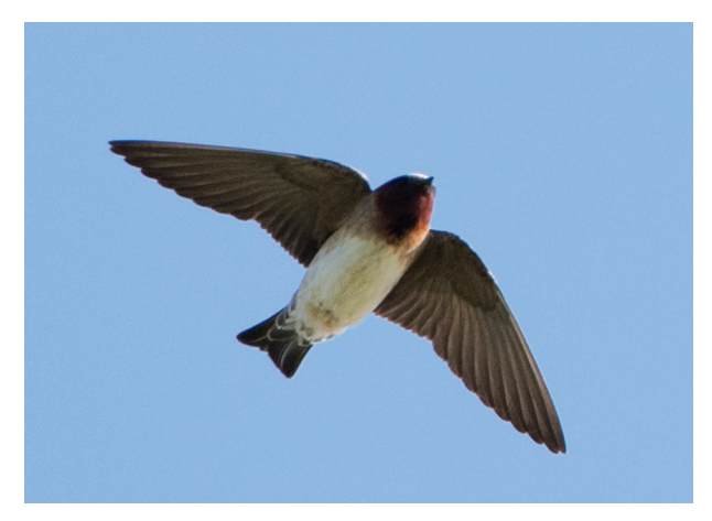
Cliff Swallow.