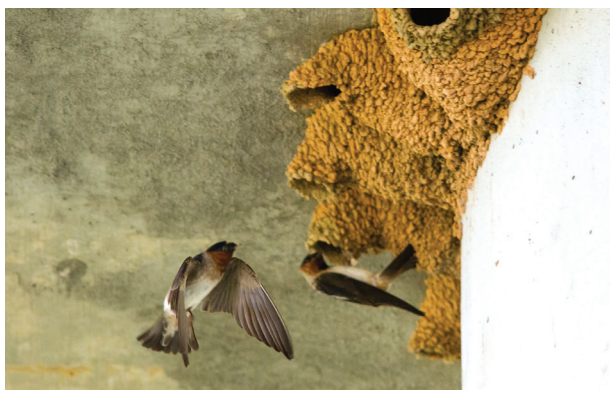
Gaston County birds collecting mud to build nests. Cliff Swallows catching insects midair and returning to their nests under a section of I-485 bridge.