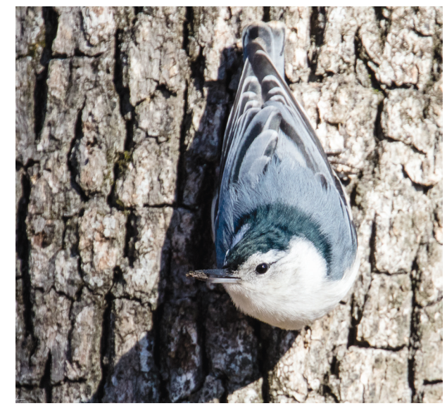
Juvenile White-breasted Nuthatch (above—Jeff Lemons). Adult (below—Gary P. Carter).

a cavity in the branch of a live white oak tree, about 35 feet off the ground. The branch jutted out perpendicular from the trunk and the hole was well protected. The tree was in the front yard of a house in a well-wooded Charlotte neighborhood, just beside a very busy residential street. This nest was used at least two years in a row. A second nest was found in a hole in the side of a cedar-sided home about 12 feet off the ground. Both nests were active in March.