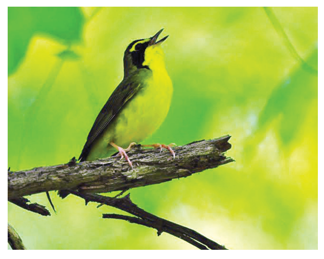
Singing Kentucky Warbler at Reedy Creek Nature Preserve. (Phil Fowler)

Kentucky Warblers have alternately been described as both "shy" and "curious" birds. They are olive-green above and bright yellow below with a black cap and black "sideburn" or "whisker" marks. They search for insects on the ground or in shrubs. They sing a loud churry-churrychurry-churry breeding song, but are often hard to get a good look at while they move about in their tangled habitat. Their nests can be quite challenging to find.