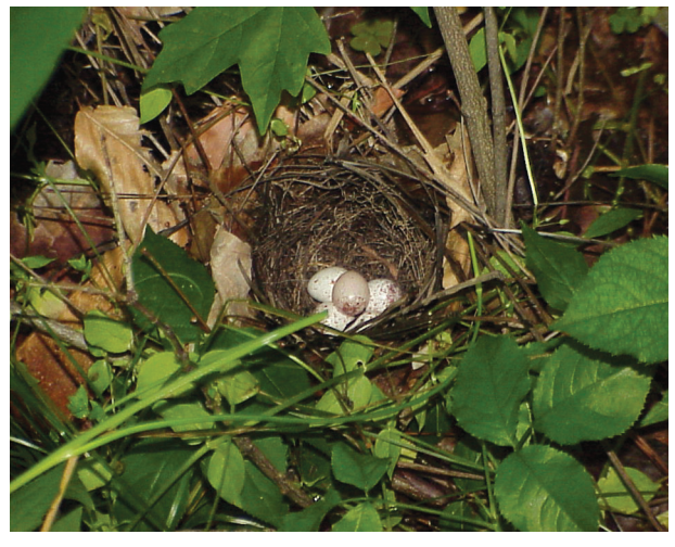
Kentucky Warbler nest at Latta Plantation Nature Preserve in 2002. (MCPRD staff)