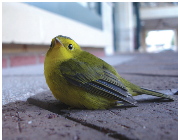
Wilson's Warbler stunned after hitting a building in downtown Charlotte.