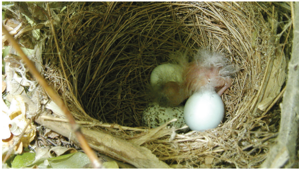
Blue Grosbeak male (Jeff Maw). Nest. (MCPRD staff)