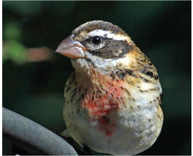
First-fall male Rose-breasted Grosbeak. (Jim Guyton)