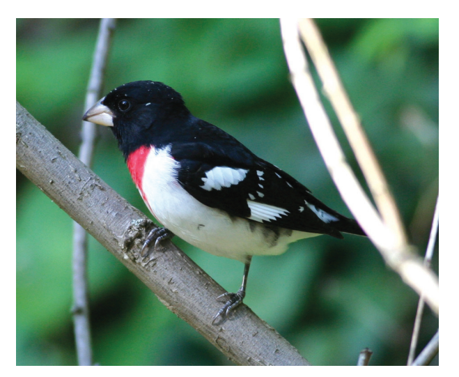
Male Rose-breasted Grosbeak. (Will Stuart)

In this region during spring migration, males usually arrive a few days before the females. Most move through from mid-April through mid-May. Our extreme spring dates are 6 April through 24 May. Mark Simpson published two reports of this bird found on the western edge of this region during the month of June. An adult male was observed at 2,600 feet on Poore's Knob in the Brushy Mountains in June 1963. Simpson found a male singing near Skull Knob in the South Mountains in Rutherford County on June 16, 1970, at an elevation of 2,800 feet. We have no other acceptable records from the months of June and July.