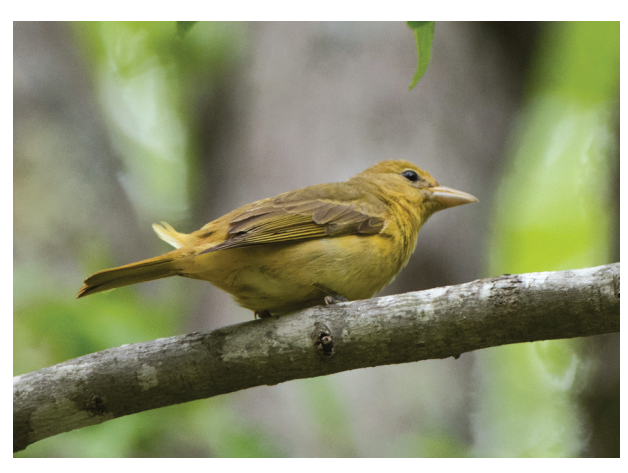
Female Summer Tanager on 1 May.