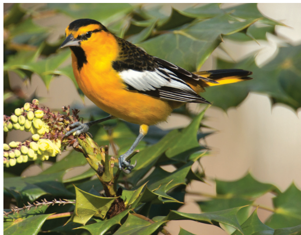
Bullock's Oriole in Charlotte.