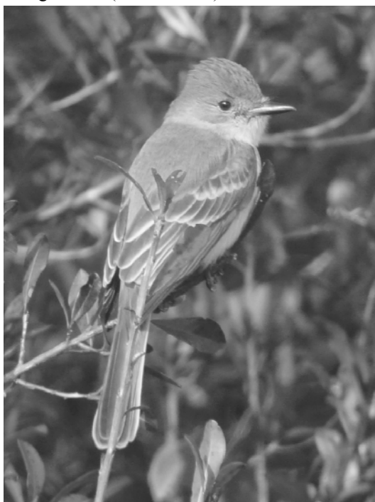
Ash-throated Flycatcher, 2 Dec 2008, Croatan NF, NC.