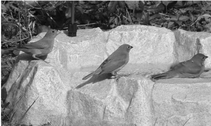
Painted Buntings, 4 Dec 2008, Wilmington, NC.

Yellow-headed Blackbird: One was seen in McClellanville, SC, during the CBC, 18 Dec ( vide NAS). An immature male was found inside a large flock of blackbirds along US 64, two miles W of Columbia, NC, 1 Jan (Ricky Davis).