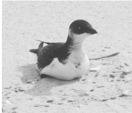
Dovekie, 19 Feb 2009, North Core Banks.