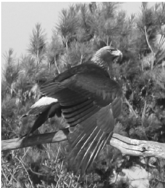
Golden Eagle, 8 Dec 2008, Donnelley WMA, SC.