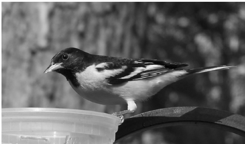
Baltimore Oriole, 16 Feb 2009, Myrtle Beach, SC.