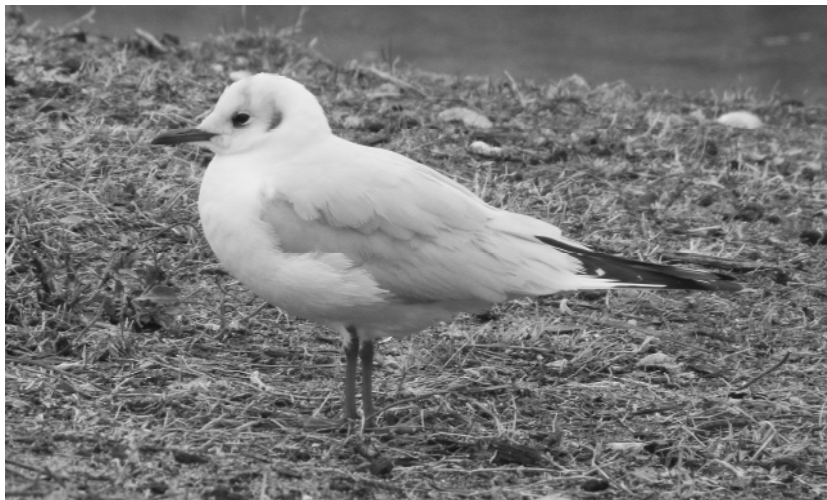
Black-headed Gull, 22 Feb 2009, Kill Devil Hills, NC.