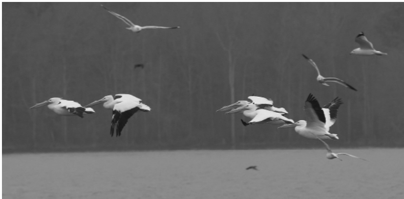
American White Pelicans, 22 Feb 2009, Jordan Lake.