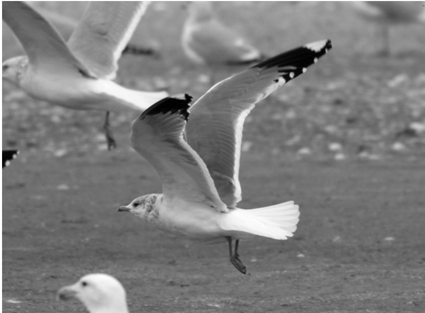
Mew (Common) Gull, 24 Jan 2009, Cape Point, NC.