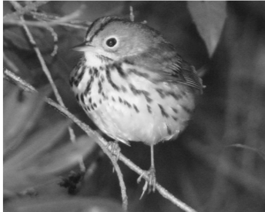
Ovenbird, 17 Dec 2008, Roanoke Island, NC.