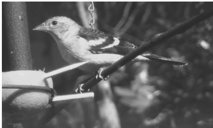
Western Tanager, 20 Feb 2009, near Wilmington, NC.