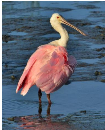
Roseate Spoonbill, 7 July 2011, Huntington Beach SP, SC.