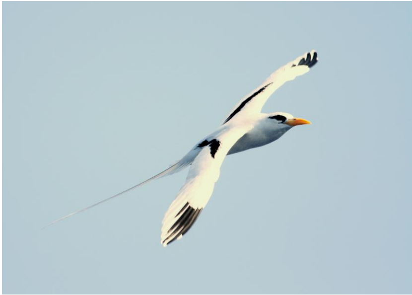
White-tailed Tropicbird, 12 June 2011, off Hatteras, NC.