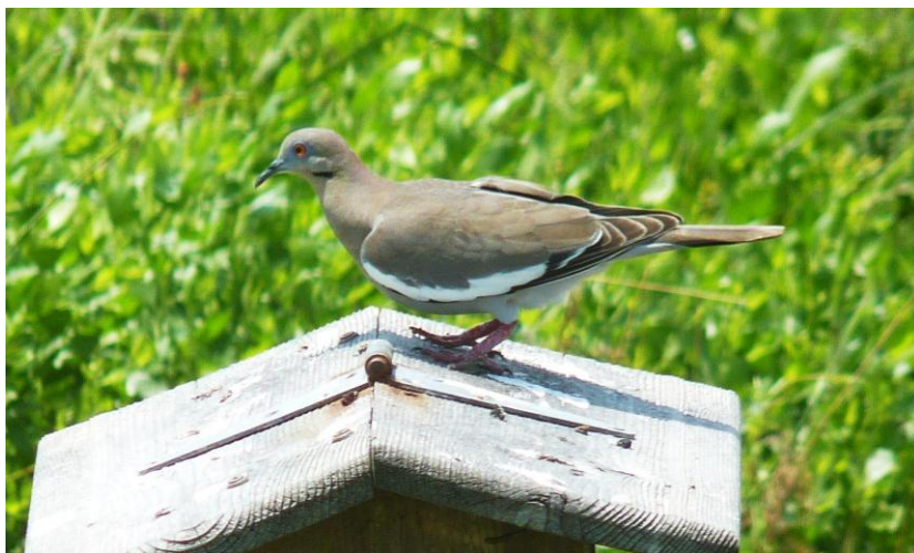
White-winged Dove, 12 June 2011, Pea Island NWR.