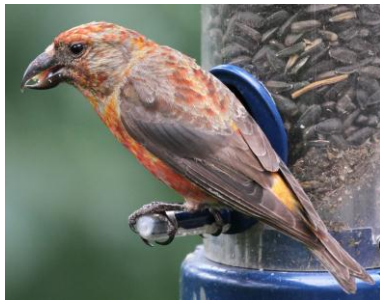
Red Crossbill, 25 July 2011, Grandfather Mountain, NC.