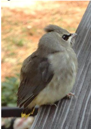
Fledgling Cedar Waxwing, 7 July 2011, Camden, SC.