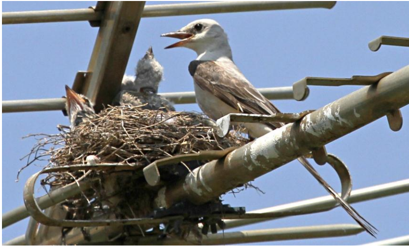
Scissor-tailed Flycatchers, 23 July 2011, Anilorac Farm.