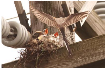
Scissor-tailed Flycatchers, 26 June 2011, near Pendleton, SC.