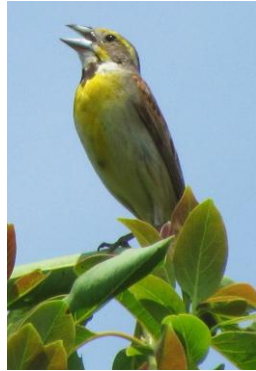
Dickcissel, 25 June 2011, Mid Pines Rd, Raleigh, NC.