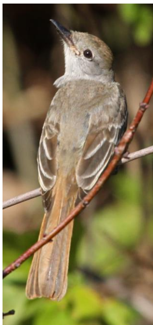
Ash-throated Flycatcher, 11 Nov 2011, Alligator River NWR, NC.