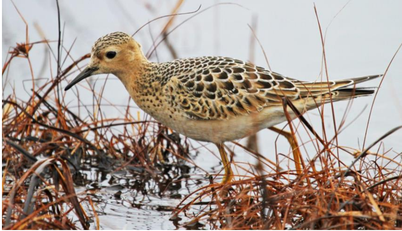
Buff-breasted Sandpiper, 24 Sept 2011, Bodie Island, NC.