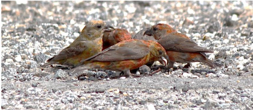
Red Crossbills, 7 Aug, Swain Co, NC.

Red Crossbill: Multiple crossbills were seen and heard along Clingman's Dome Rd and at Newfound Gap, Swain Co, 5 Aug (Irvin Pitts). ~10 were photographed ingesting grit along the side of a road near Smokemont, Swain Co, NC, 7 Aug (Pitts). Four were seen at Mt Mitchell SP, 2 Nov (Marilyn Westphal, Mark Simpson).