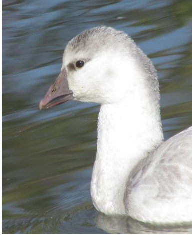
Ross's Goose, 23 Oct 2011, Cary, NC.