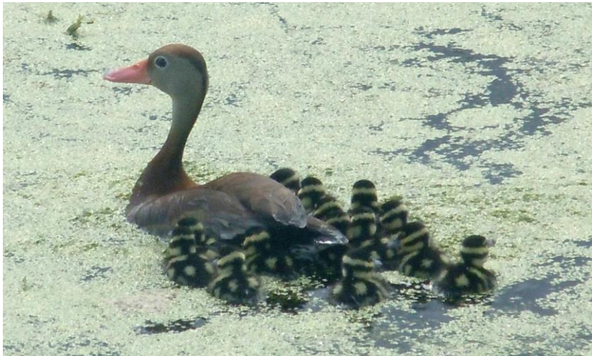
Figure 1. Black-bellied Whistling-Duck ( Dendrocygna autumnalis ) with ducklings in the Hume Pond of the Tom Yawkey Wildlife Center, Georgetown, SC. Photo taken 2 July 2007.

On 5 June 2011, Bryan Reece, TYWC Natural Resource Technician, observed three pairs of Black-bellied Whistling-Ducks in the Lower Hume Pond and Summer Duck Pond. These ponds are adjacent to each other on the Cat Island portion of the TYWC. On 2 July 2011, a Black-bellied Whistling-Duck with 12 ducklings was observed and photographed (Fig. 1) by Dozier in the Lower Hume Pond area of Cat Island (N33.21075°, W79.26611°). This is the northernmost observation of nesting along the east coast and the first record of nesting in the Santee Delta–Winyah Bay region.