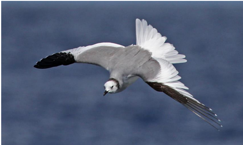
Sabine's Gull, 4 Sep 2011, off Oregon Inlet, NC.

Black-legged Kittiwake: A juvenile was photographed on the beach in North Topsail Beach, Onslow Co, NC, 21 Nov (Gilbert Grant).