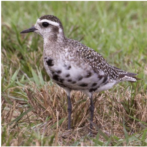
American Golden-Plover, 25 Sept 2011, Bladen Co, NC.