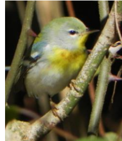
Northern Parula, 11 Dec 2011, Greenville, SC.