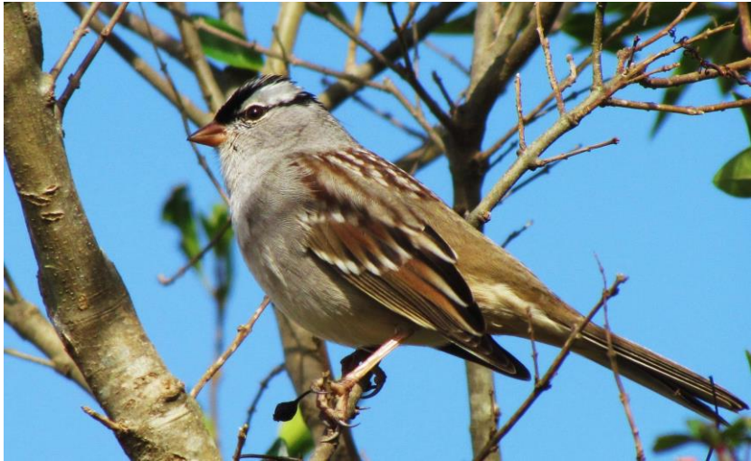
White-crowned Sparrow, 26 Nov 2011, Orange Co, NC.