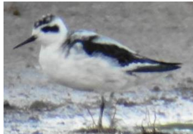
Red-necked Phalarope, 6 Sep 2011, Henderson Co, NC.