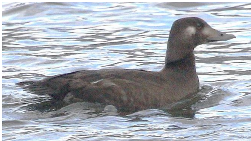
White-winged Scoter, 19 Nov 2011, Lake Junaluska, NC.

Surf Scoter: Monroe Pannell found a female on Lake Hickory, NC, 30 Oct.