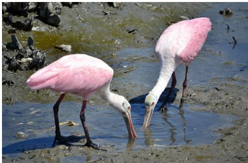
Roseate Spoonbills, 8 Sept 2011, Huntington Beach SP.