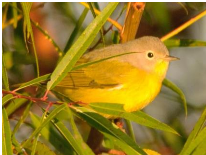
Nashville Warbler, 27 Oct 2011, Clemson, SC.

Orange-crowned Warbler: Sightings included an adult male in Graham Co, NC, 5 Sep (Cherrie Sneed); three at Patriot's Point, Mt Pleasant, SC, 16 Sep (John Cox); one photographed at Ebenezer Point, Jordan Lake, NC, 8 Oct (Mike Tove); and one at Cowan's Ford WR, Mecklenburg Co, NC, 24 Oct (Kevin Metcalf).