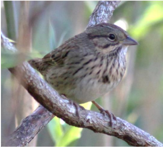
Lincoln’s Sparrow, 6 Oct 2011, Bryson City, NC.