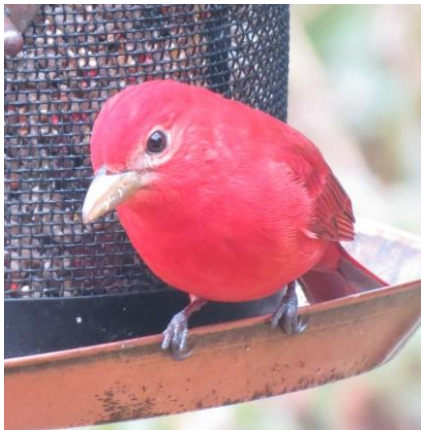
Summer Tanager, 17 Dec 2011, Raleigh, NC.