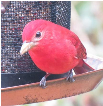
Summer Tanager, 17 Dec 2011, Raleigh, NC.