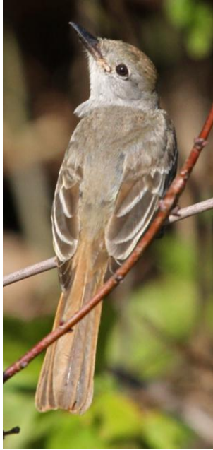
Ash-throated Flycatcher, 11 Nov 2011, Alligator River NWR, NC.