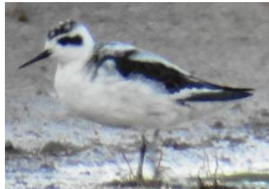
Red-necked Phalarope, 6 Sep 2011, Henderson Co, NC.