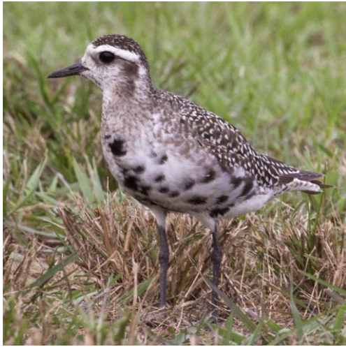
American Golden-Plover, 25 Sept 2011, Bladen Co, NC.