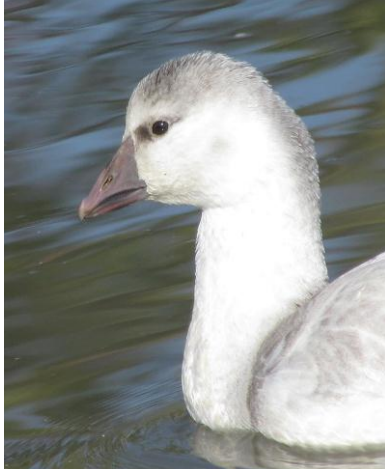
Ross's Goose, 23 Oct 2011, Cary, NC.