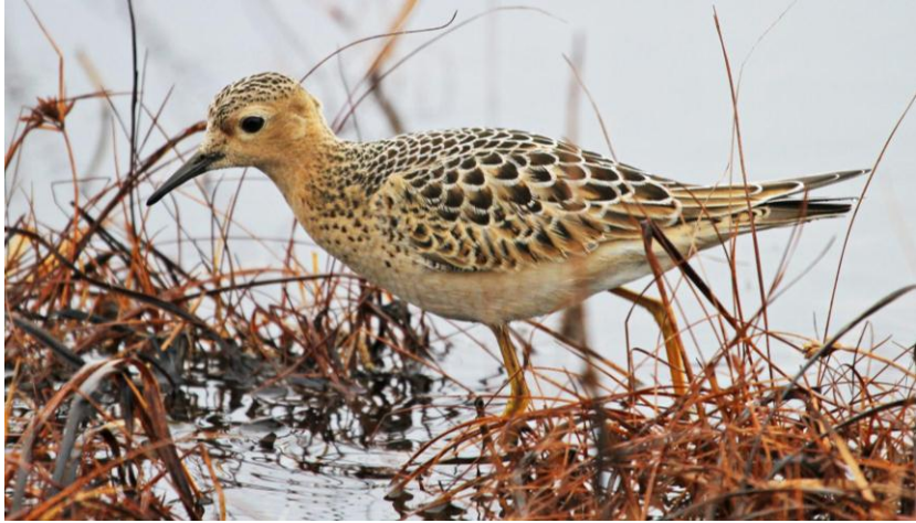
Buff-breasted Sandpiper, 24 Sept 2011, Bodie Island, NC.