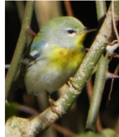
Northern Parula, 11 Dec 2011, Greenville, SC.