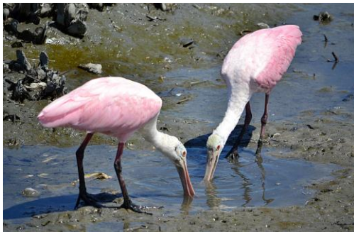
Roseate Spoonbills, 8 Sept 2011, Huntington Beach SP.