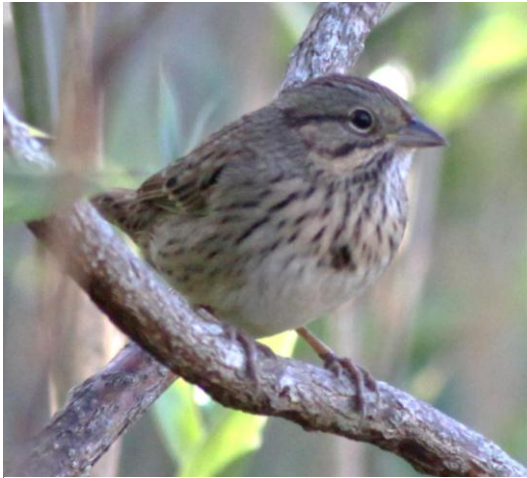
Lincoln’s Sparrow, 6 Oct 2011, Bryson City, NC.