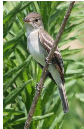
Willow Flycatcher, 30 June 2012, Raleigh, NC.