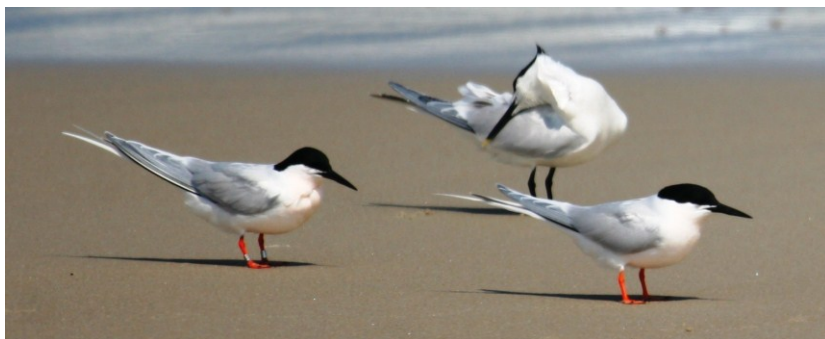
Roseate Terns (with Sandwich Tern), 21 June 2012, Cape Lookout, NC.