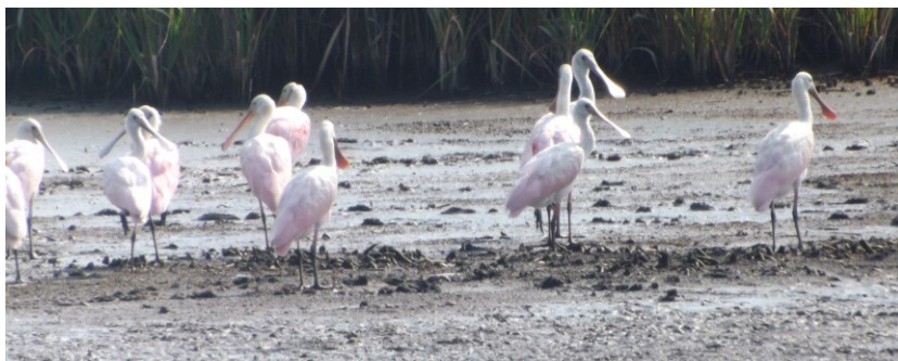
Roseate Spoonbills, 14 June 2012, Bear Island WMA, SC.