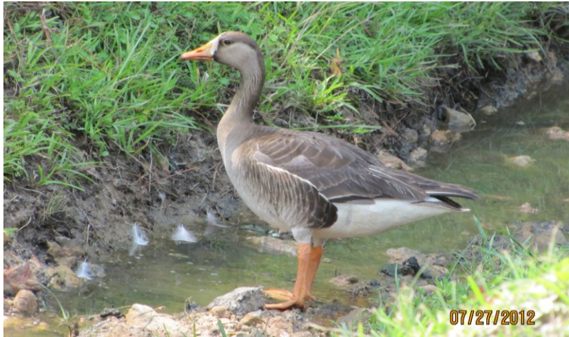
Greater White-fronted Goose, 27 July 2012, Charleston Southern University, SC.