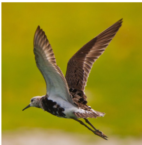
Ruff, 12 July 2012, Cedar Island, NC.

Roseate Tern: One was seen during a fishing trip off Hatteras, NC, 6 June (Brian Patteson). National Park Service staff photographed two, one leg-banded, on the beach near the lighthouse at Cape Lookout, NC, 21 June (Felicia Nawn, vide Jon Altman).