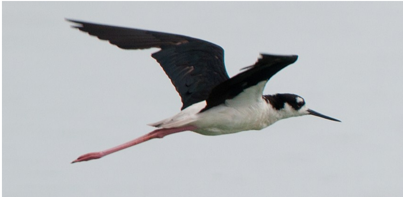
Black-necked Stilt, 12 July 2012, Cedar Island, NC.