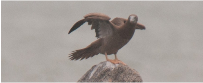
Juvenile Brown Booby, 10 June 2012, Huntington Beach State Park, SC.