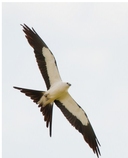
Swallow-tailed Kite, 19 July 2012, Millet, SC.