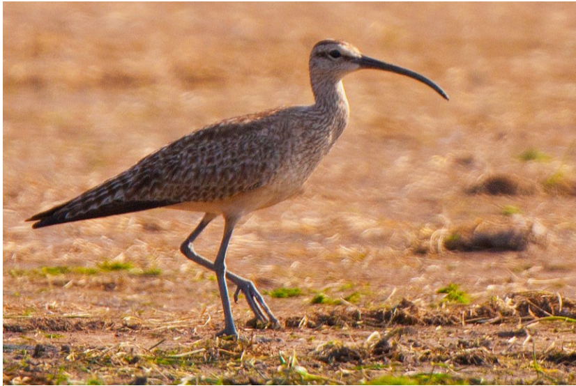
Whimbrel, 29 July 2012, Mills River, NC.