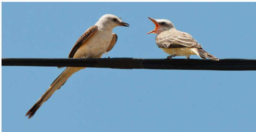
Scissor-tailed Flycatchers, 15 July 2012, Rock Hill, SC.