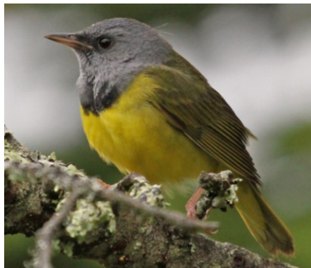
Mourning Warbler, 5 June 2012, Richland Balsam Overlook, NC.