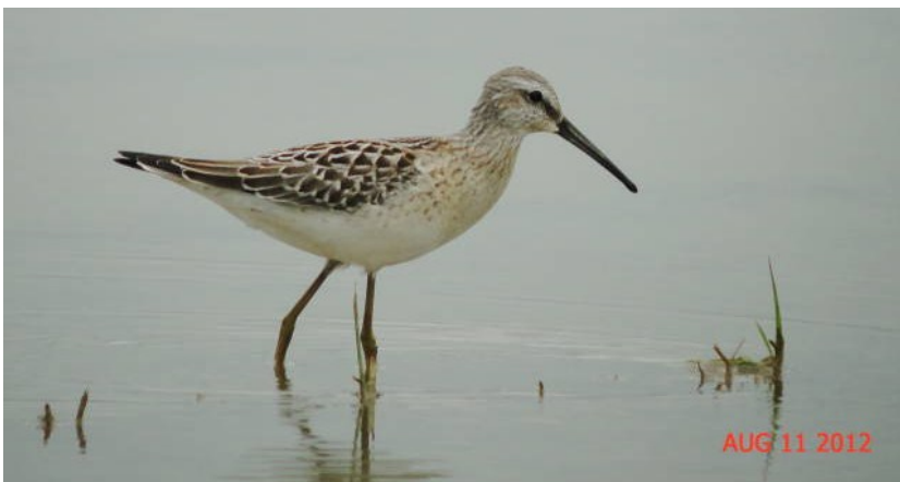
Stilt Sandpiper, 11 August 2012, Henderson County, NC.