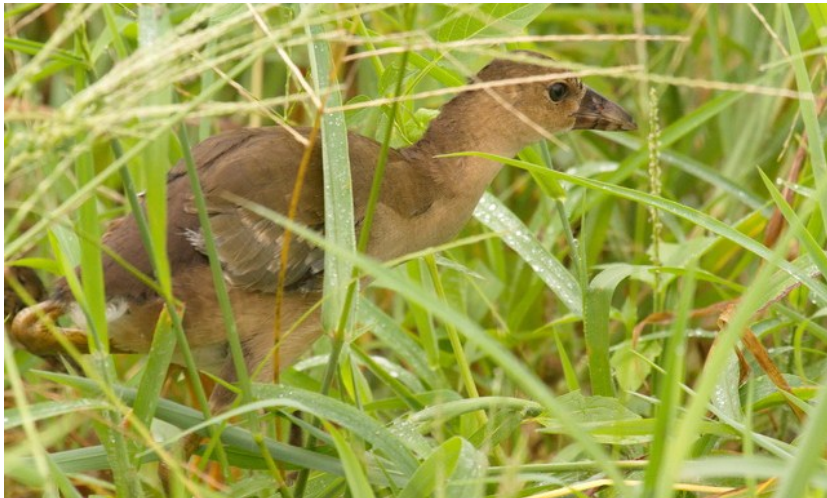
Juvenile Purple Gallinule, 31 July 2012, Savannah NWR, SC.

Purple Gallinule: Breeding was confirmed at two sites in SC—at Donnelley WMA, Colleton Co, where five birds, including two chicks, were seen 27 July (Willy Hutcheson); and at Savannah NWR, Jasper Co, where multiple adults and juveniles were photographed 31 July (Cathy Miller). One in the swamp behind Mullet Pond at Huntington Beach SP, SC, 7 June (Stu Gibeau) was a good find for that site.