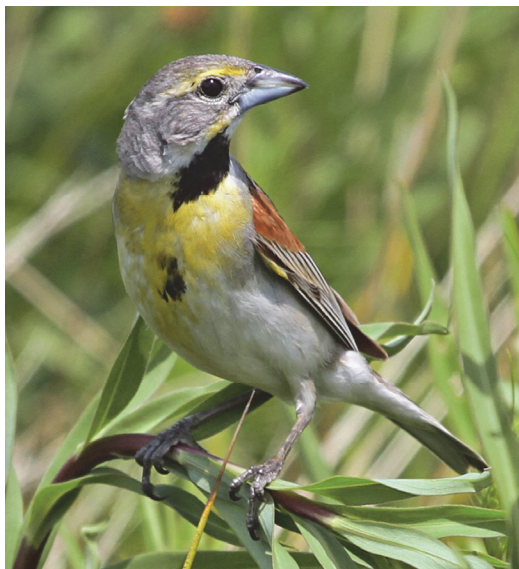
Dickcissel, 11 Jul 2013, MacKay Island NWR, NC.