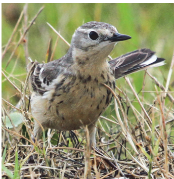
American Pipit, 07 Jun 2013, Dare County, NC.