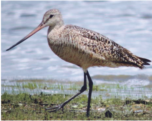
Marbled Godwit, 06 Jul 2013, Henderson County, NC.