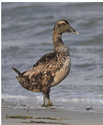
Common Eider, 08 Jun 2013, Dare County, NC.