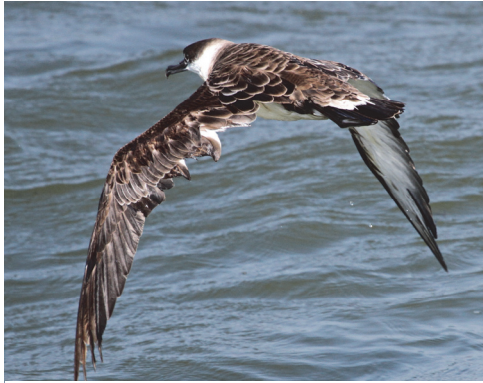
Great Shearwater, 08 Jun 2013, Oregon Inlet, Dare Co, NC.