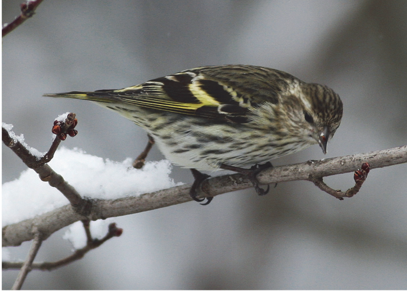
Pine Siskin, 20 Jan, Matthews, NC.