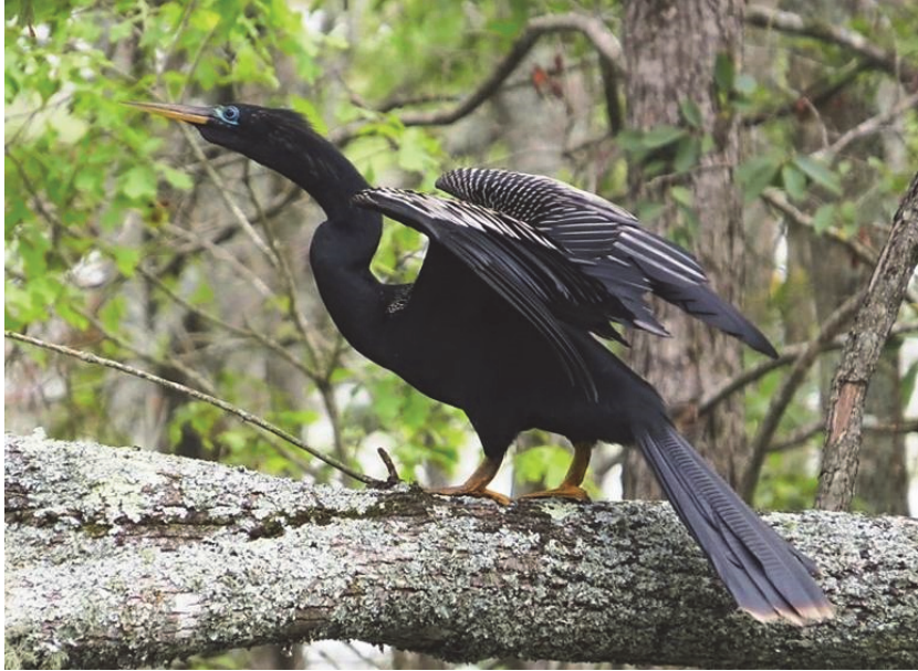
Anhinga, 22 Jun 2013, Pee Dee NWR, NC.