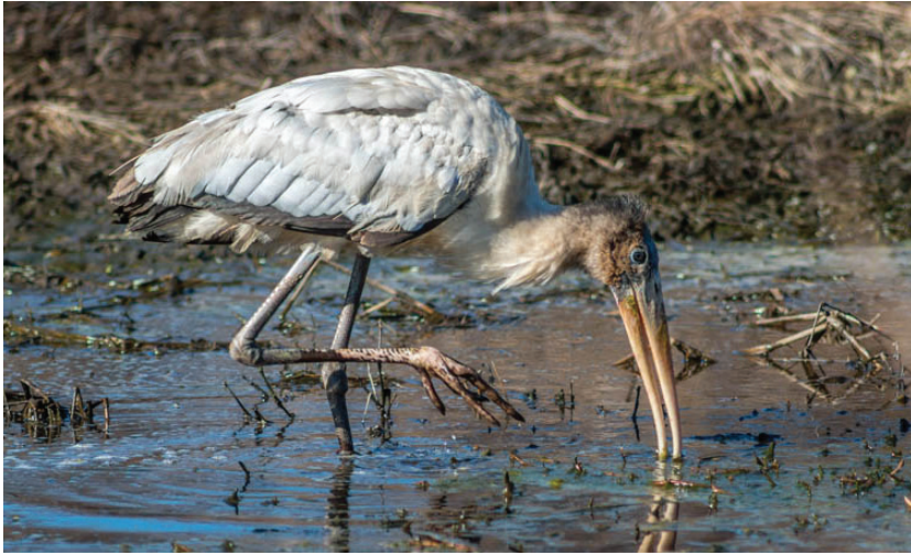
Wood Stork, 29 Jan 2017, Washington Co, NC.