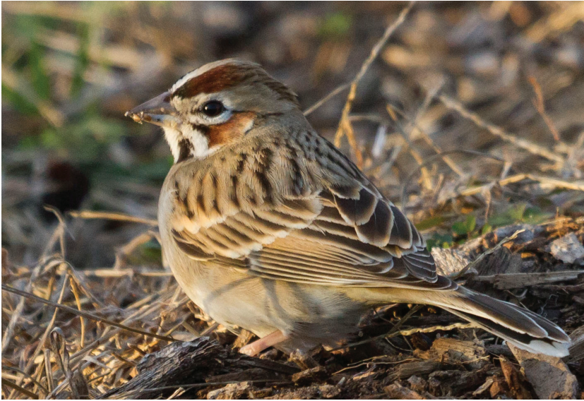
Lark Sparrow, 12 Jan 2017, Dare Co, NC.