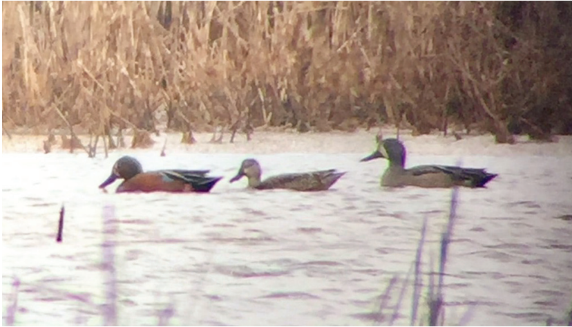
Blue-winged x Cinnamon Teal, 21 Feb 2017, Charleston Co, SC.