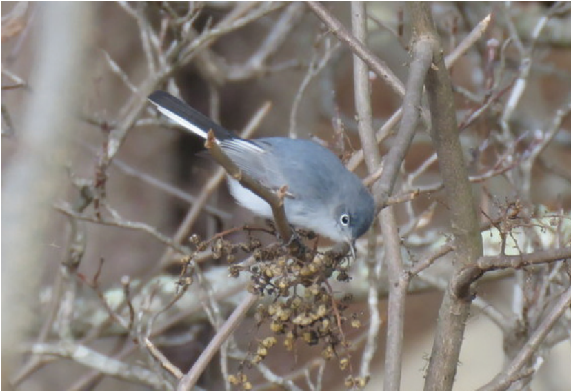
Blue-gray Gnatcatcher, 5 Jan 2017, Haywood Co, NC.