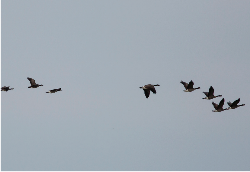
Cackling and Canada Geese, 10 Jan 2017, Washington Co, NC.