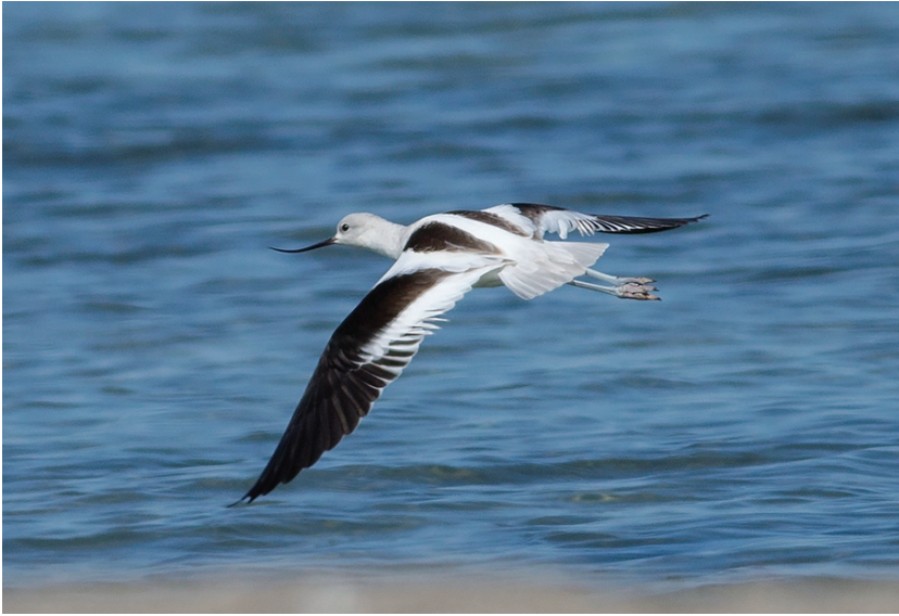
American Avocet, 19 Feb 2017, Carteret Co, NC.