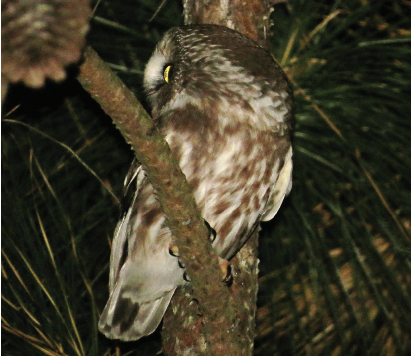
Northern Saw-whet Owl, 9 Dec 2016, Dare Co, NC.