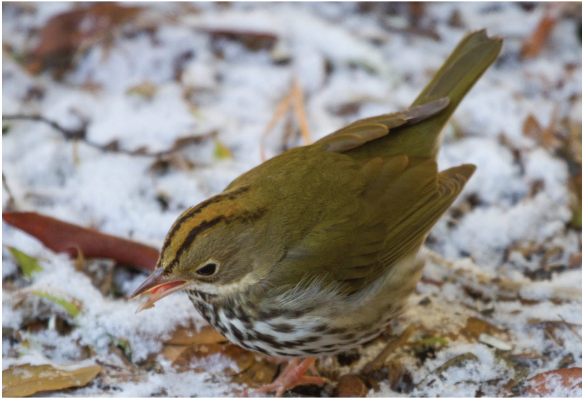
Ovenbird, 8 Jan 2017, Dare Co, NC.