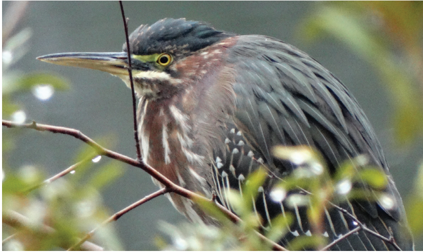
Green Heron, 1 Jan 2017, Richland Co, SC.