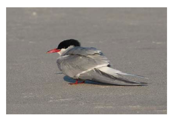
Arctic Tern, 25 Apr 2018, Carteret County, NC

Arctic Tern: One was photographed on the beach at Ft Macon SP, Carteret Co, NC, following several days of strong easterly winds, 25 Apr (Martin Wall).