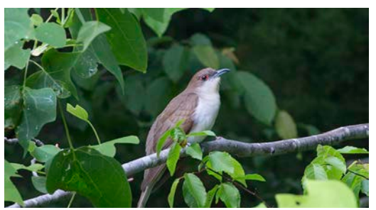
Black-billed Cuckoo, 20 May 2018, Rockingham County, NC

Black-billed Cuckoo: A pair appeared to be on territory along Tyne Rd in northwest Rockingham Co, NC, 7-29 May (Martin Wall, m. obs.), though no evidence of