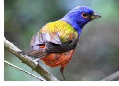
Painted Bunting, 7 May 2018, New Hanover County, NC

Painted Bunting : North and inland of the species' typical range were individual males visiting feeders in Raleigh, Wake Co, NC, 4 Mar (David