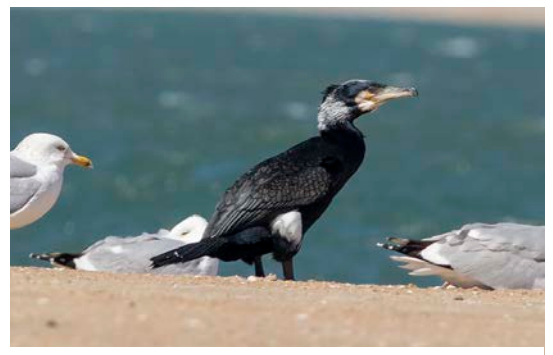
Great Cormorant, 18 Mar 2018, Carteret County, NC