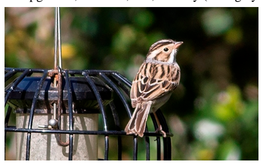
Clay-colored Sparrow, 20 Apr 2018, Carteret County, NC