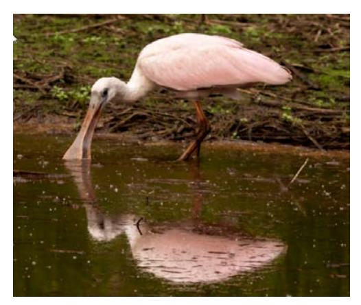
Roseate Spoonbill, 27 May 2018, Mecklenburg County, NC