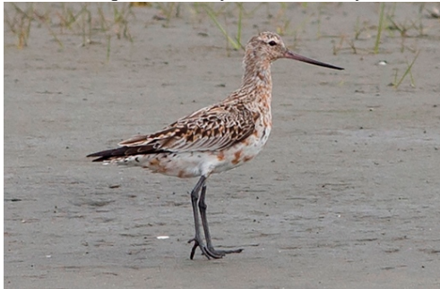
Bar-tailed Godwit, 23 Apr 2018, Carteret County, NC