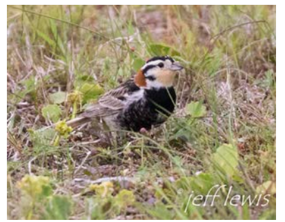
Chestnut-collared Longspur, 17 May 2018, Dare County, NC