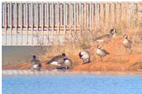
Cackling Geese (with Canada Geese), 19 Dec 19, Greenville Co, SC.

were included with the report. The photos showed the Cackling Geese adjacent to Canada Geese, which allowed the Committee to make a judgement on their size.