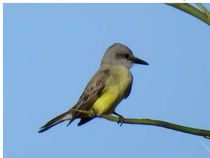
Tropical Kingbird, 16 Jun 19, Charleston Co, SC.

Tropical Kingbird ( Tyrannus melancholicus ). 2019-004. Accept (9-0). Craig Watson submitted a very detailed report along with eight photos of a Tropical Kingbird at Ft. Moultrie National Monument (Charleston Co.) on 16 June 2019. This is the second record of Tropical Kingbird for South Carolina, with the first being seen in 2018.