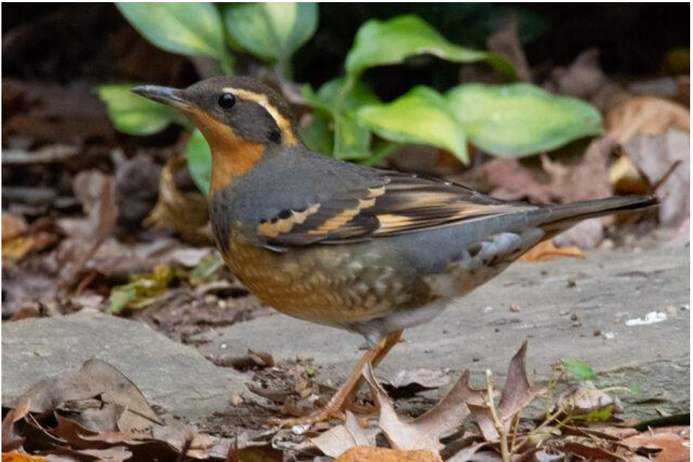
Varied Thrush, 4 Dec 2020, Cary, Wake County, NC.