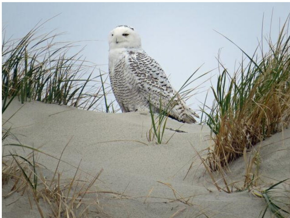
Snowy Owl, 14 Jan 2021, Hyde County, NC.