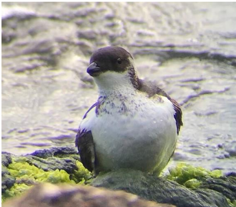
Dovekie, 6 Mar 2021, Georgetown County, SC.