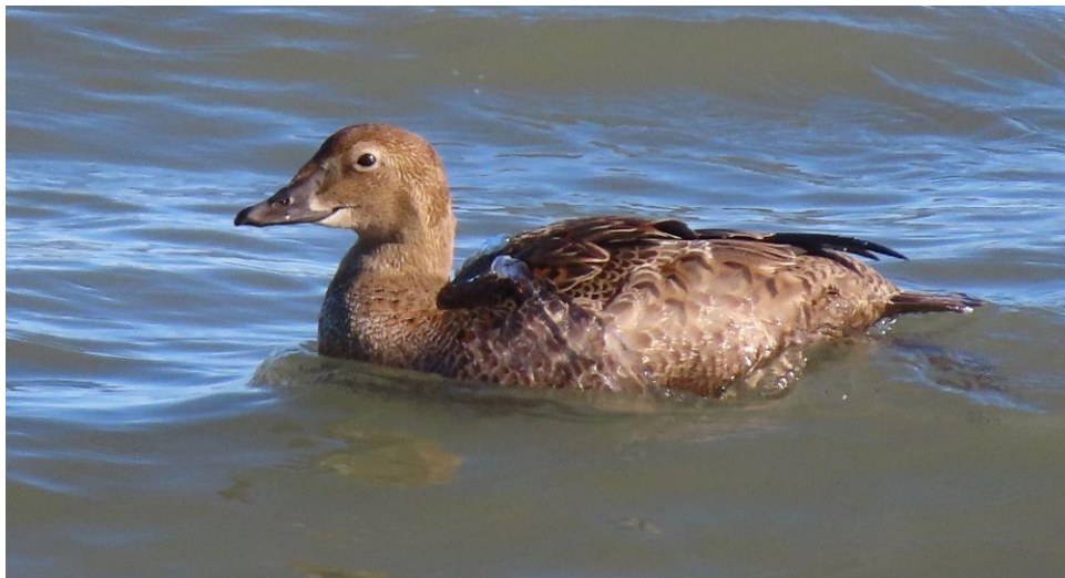
King Eider, 8 Dec 2020, Jennette’s Pier, Dare County, NC.