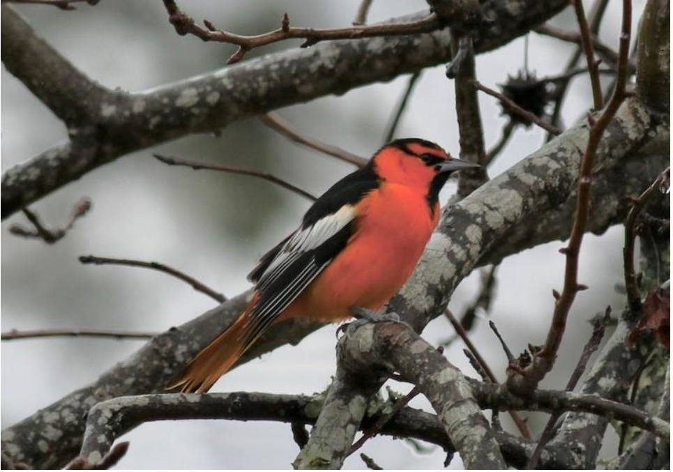
Bullock's Oriole, 1 Jan 2021, Morehead City, Carteret County, NC.

three miles apart and there was no overlap in dates of sightings. The bird in Carteret, according to the homeowner, was present the two previous winters.