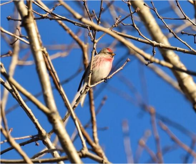
Common Redpoll, 20 Feb 2021, Alexander County, NC.