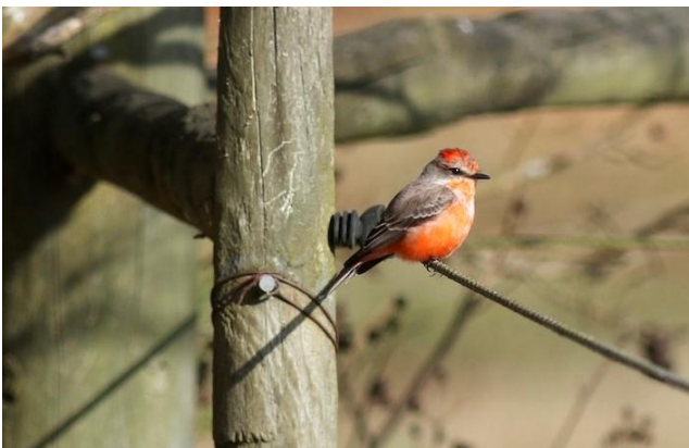
Vermilion Flycatcher, 11 Dec 2020, near Williamston, Martin County, NC.