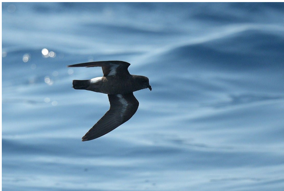
European Storm-Petrel, 3 Jun 2022, off Hatteras, Dare County, NC.