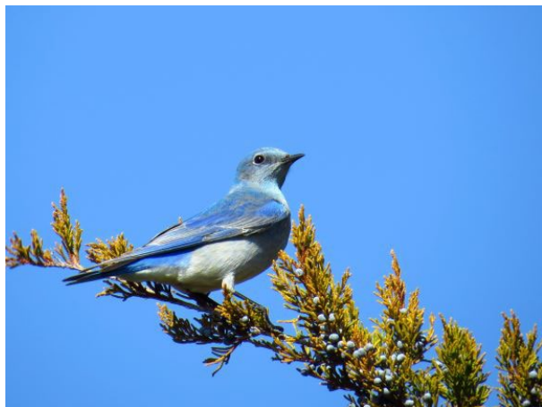
Mountain Bluebird, 14 Feb 2022, Wrightsville Beach, New Hanover County, NC.

Mountain Bluebird: The male Mountain Bluebird discovered in Wrightsville Beach New Hanover NC 11 Feb (Ken Hackney, m. obs.) continued at that site until last seen 21 Mar (Curtis Downey).