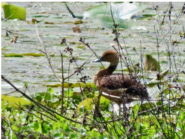
Apparent Fulvous Whistling-Duck, 20 Apr 2022, Savannah NWR, Jasper County, SC.