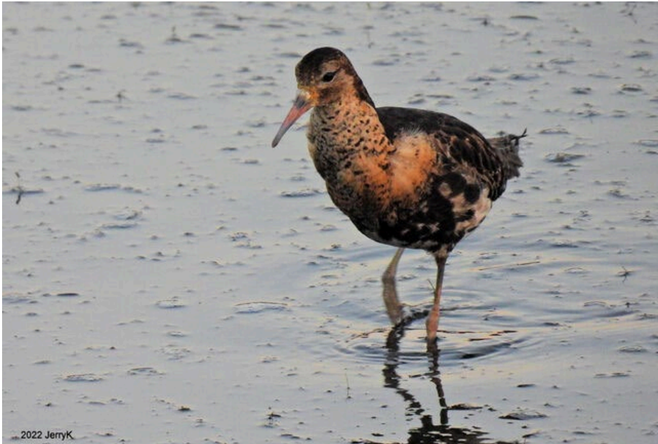
Ruff, 30 May 2022, Huntington Beach State Park, Georgetown County, SC.