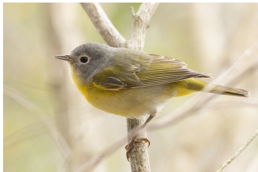
Nashville Warbler, 18 Jan 2023, Apex Community Park, Wake County NC.