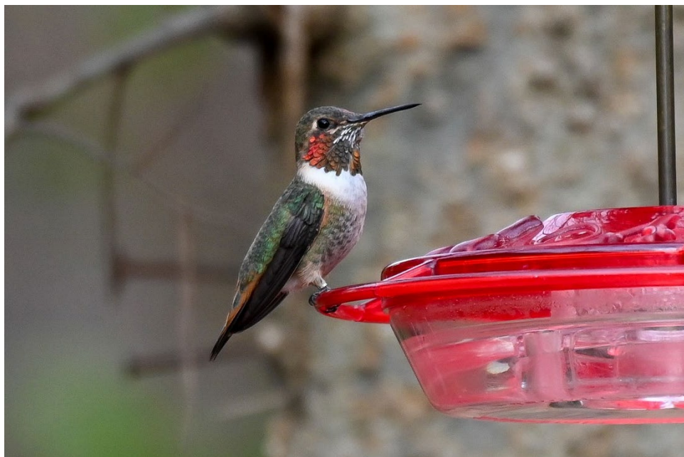
Anna's x Allen's Hummingbird, 8 Feb 2023, Concord, Cabarrus County NC. Note silver band on right leg.