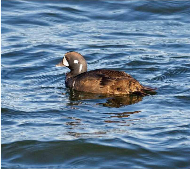
Harlequin Duck, 28 Dec 2022, Dare County NC.