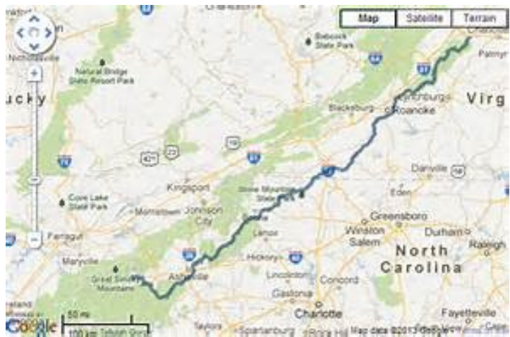
Blue Ridge Parkway through North Carolina and northern Virginia.

Parking alongside the Parkway can be limited. Please plan to carpool as we will endeavor to combine into as few vehicles as possible. Environmental hazards are few, and annoying insects are not usually problematic, but bring a rain jacket and sweater in case of showers or cool weather.