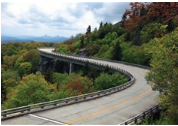
America's Favorite Drive—the Blue Ridge Parkway from motorhome.com.

Are you a fan of warblers? Then this trip is for you. Mid to late September is the peak of fall migration for warblers in the Carolinas.