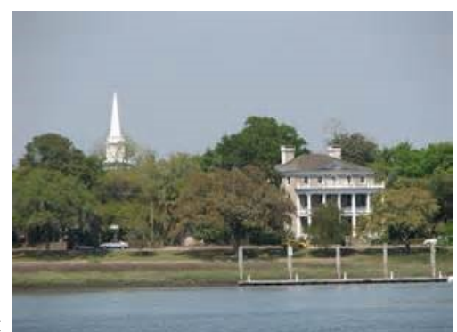
Scenic and Historic Beaufort, SC

cluding managing the Francis Beidler Forest and Silver Bluff Sanctuary. Our headquarters for the meeting is the Quality Inn at Town Center, located at 2001 Boundary Street in downtown Beaufort.