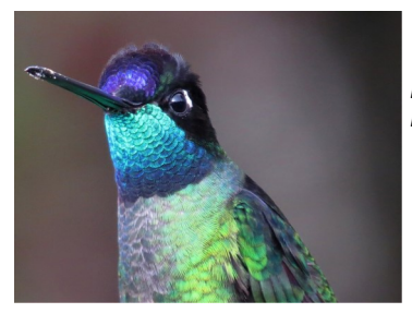
Magnificent Hummingbird. at Poasito.