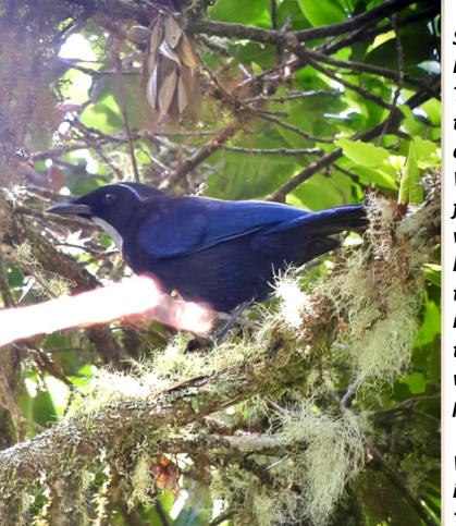
Silvery-throated Jay. This was my favorite bird of the trip. It is a very rare species endemic to Costa Rica and Western Panama. They are found in the highlands and are very difficult to find foraging high up in the canopy. We had to take 4x4 jeeps halfway up the mountain and hike the rest of the way up. We were rewarded with good looks and even pictures of this amazing bird!

We also saw 11 mammal species including Three-toed and Two-toed sloths.