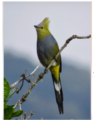
Long-tailed Silky Flycatcher. at Miriam's Restaurant, near Savegre Mountain Lodge. Silky-flycatchers are more closely related to the thrushes and waxwings than to tyrant flycatchers. We also had good looks at its relative the Black-and-yellow Silky-flycatcher.