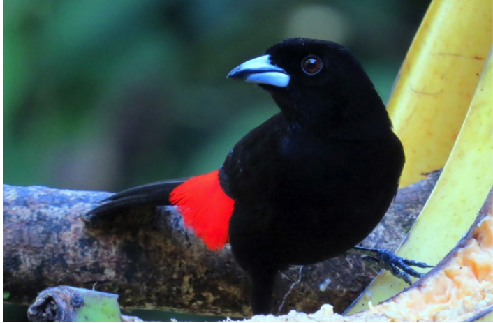
Passerini's Tanager. Photo by Sherry Lane at La Quinta.