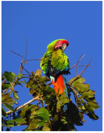
Great Green Macaw. near La Selva OTS. Unfortunately, these amazing creatures are endangered despite efforts to protect them.