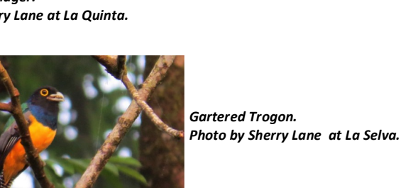
the avocado trees you can find them feeding there in the highlands of Savegre.

Resplendent Quetzal!