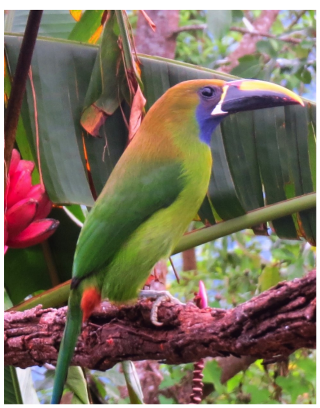
Emerald Toucanet. taken at Cinchona . Everyone loves a Toucan! We also saw lots of Collared Aracaris, Yellowthroated and Keel-billed Toucans.