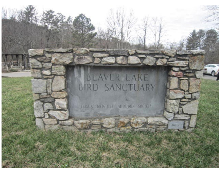
Beaver Lake Bird Sanctuary, Asheville, NC

Please go to the meeting registration room after you check into the hotel. Trip directions and a list of