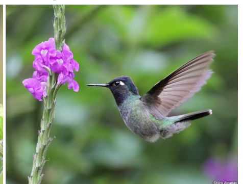
Violet-headed Hummingbird.