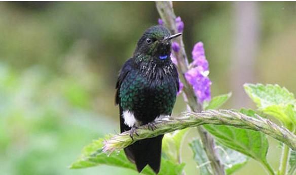
Black-breasted Puffleg. Image by BenjiSchwartz.