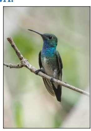
This CBC bonus birding trip will take in some of the very best areas Costa Rica has to offer!

We will begin in the Pacific lowlands birding our way up to the cooler lush cloud-forests for 3 days of exciting birding in the Monteverde area, which is home to the gorgeous Resplendent Quetzal! Next, we will move from the Pacific slope to the Caribbean and the habitat and avifauna will shift radically! We will be staying for 2 nights at the beautiful Arenal Observatory Lodge at the foot of the Arenal Volcano. Birding this area is always fabulous! Finally, we will descend into the Caribbean lowlands for a 3-night stay at the lovely La Quinta Lodge in the Sarapiqui River Valley. Here, we will explore the rain forests of La Selva Biological Station, which is one of the best birding sites in Costa Rica! We will also be visiting other key birding areas, including La Virgen del Socorro, Cope's famous feeders, the Old Butterfly garden, and La Paz Waterfall Gardens. Please see CBC website link for more details!