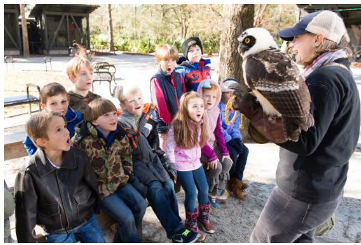
Education Program at the Avian Conservation Center

The natural alignment between the missions of the Avian Conservation Center ("the Center") and the Carolina Bird Club ("the Club") which address research, education, and conservation initiatives of birds of the Carolina and their